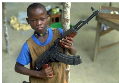
Child soldier in Sierra Leone

I could not wrap my head around some priorities of the Reagan administration, having left early in the Carter years. How could I share my concerns with pastors and parishioners over issues of Church and Ministry here while theirs