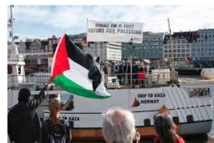
Gaza Freedom Flotilla 2018 (jfp.freedomflotilla.org)

The day was replete with details of pervasive subterfuge within our government - a condition Ray McGovern, former CIA analyst, attributes to the overlapping designs of the “Military- Industrial-Congressional-Intelligence-Media Complex,” and the control of the media by the CIA. Former Army Colonel, and US diplomat, Ann Wright, who resigned from government service in opposition to the Iraq war, and embraced the role of international peacemaker, strongly suggested that a model for hope, and an antidote to despair and “craziness,” is the commitment to Citizen Activism. As an