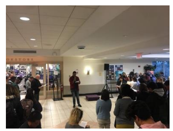
Fall Migrants event at Holy Cross

Each week we host an hour-long meeting centered around a certain issue in which leaders present educational material that opens to a discussion. This past semester, we covered topics such as gun violence, environmental justice, poverty and homelessness, DACA