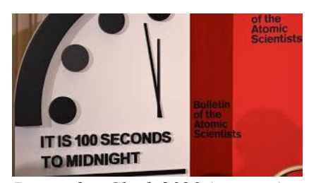
Doomsday Clock 2020

Intensifying these grievous concerns are the "corruption of the information ecosphere...by governments using cyber-enabled disinformation campaigns to sow