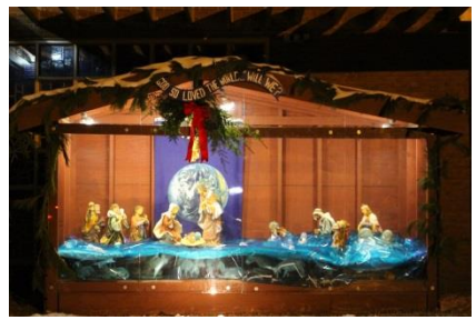
St. Susanna crèche Christmas 2019

Because all good gatherings are fruitful, it is clear that beyond the diagnosis of the problems we face, small things are happening in the afterwards of the day. I can report a few efforts arising from the St. Susanna community. Weeks after the assembly, as we segued into Advent, our Christmas creche