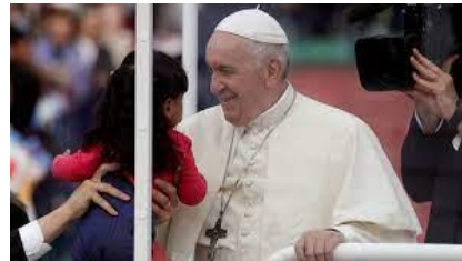
Pope Francis in Hiroshima 2019

against the stranglehold of nuclear belligerence by the big powers, the awareness of the obvious, ongoing, and hidden desecration of people and the environment because of them, and supported by Pope Francis' condemnations, he was ready to speak: no more justified