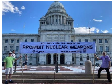
PCRI members at RI State House https://paxchristiri.wordpress.com/

We continue to meet with our U.S. Senators and Representatives via zoom in collaboration with other peace groups, like the American Friends Service Committee (AFSC), to speak out against the bloated U.S. military budget and nuclear arms. We have received polite responses but no major changes in policy positions yet.