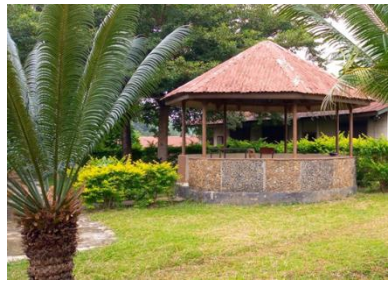
A "peace hut" at Kenema Pastoral Center: https://kenemadiocese.org/

From 1995 to 1999 I was the director of a pastoral center in Kenema that at one time served people from many parts of Africa offering courses in Integral Human Development. Our main programs were catechetical in nature, occasional retreats, but also very practical courses like farmers cooperatives, youth empowerment, women's empowerment. I went