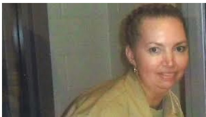
Lisa Montgomery

Lisa was the first woman to be executed by the federal government in 67 years. We read aloud written narratives based on information gleaned from their distressing histories of abuse and neglect. For instance, Lisa, guilty of a murder committed in 2004, was imagined to say, "I was born with brain damage because my mom was alcoholic and couldn't stop drinking... (she) was violent and forgot about us - or got so mad