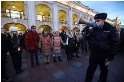
Russians in St. Petersburg protest the war in Ukraine

The Ukraine war has greatly intensified the choice between life and death. Either we will continue to live our way into the new story of right relationships and commit to developing and scaling up diverse, powerful nonviolent tools to address root causes of conflict before it reaches such catastrophic proportions, or we will remain stuck in the old story that violence and war are inevitable.