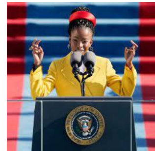
Inaugural poet Amanda Gorman

Once again, what we are birthing will be closer to the beloved community; it will be anti-racist, diverse and socially just. It will be built on right relationships with each other and with the natural world. It will not depend on weapons of war but on a commitment to inclusive human dignity and respect for the integrity of creation. It will be diverse, nonviolent, a new way of being viewed through the prism of justice.