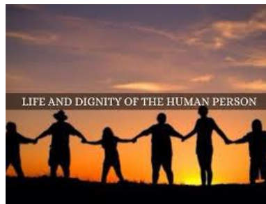
From a student death penalty video