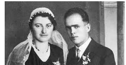
Newlyweds, 1936

As followers of Jesus, through prayer, we subvert the present unjust order by recognizing God is the only king. There is no other God. The Lord’s Prayer radically relativizes every human scheme and utopia. Being treated as anarchists and subverters of conventional social and political order does not surprise ardent Christians.