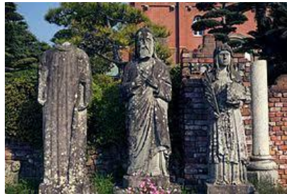
Bombed statues at rebuilt Catholic Cathedral, Nagasaki

On July 16, 1945, the first atomic bomb test, code-named “Trinity,” was conducted in an area of desert in New Mexico called Jornada del Muerto - Journey of Death. “We knew the world would not be the same,” recalled J. Robert Oppenheimer, chief scientist of the Manhattan Project, which was responsible for the development of the world’s first nuclear weapon. As he witnessed the test, Oppenheimer remembered the line from the Hindu Scripture, the