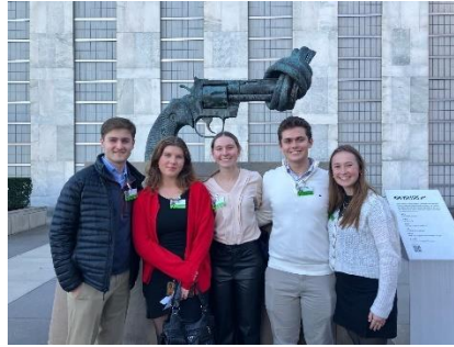
Holy Cross students at UN, NYC