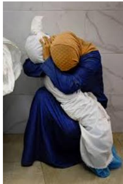
Palestinian woman embraces the body of her niece

Jesus' reaction would be to the reality that the Israeli Defense Forces (IDF), since October 2023, under Israeli Prime Minister Netanyahu's direction and with US military aid currently totaling $11 million every hour , has intentionally killed tens of thousands of children, women, and other noncombatants. As of this writing, U.S. President Trump has promised to bypass the Congress and immediately send Israel an additional $8 billion for missiles and other weaponry to further eradicate Palestinians and to continue leveling Gaza for his stated goals of annexation and ethnic cleansing.