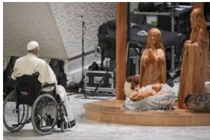
Pope Francis prays at Palestinian-made Vatican creche, with Jesus wrapped in a keffiyeh

Yet with all the problems in our own life and the world, should we Christians be concerned about their plight? What, if anything, would Jesus want us to do? We Christians believe that from Its infinite love and compassion for us, the Trinity Incarnated Itself in human form, beginning like us, a helpless infant.