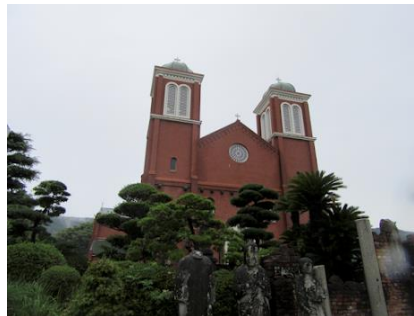
Urakami Cathedral (St. Kateri Institute)