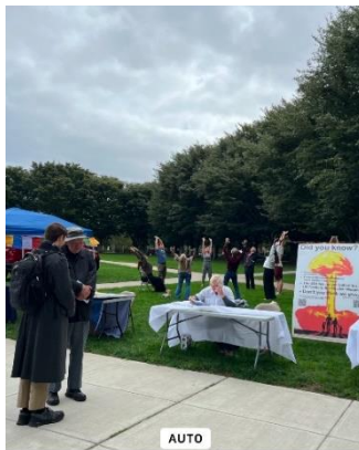
PCRI table at URI

Every fall, Pax Christi Rhode Island is invited onto the University of Rhode Island campus by the URI Center for Nonviolence and Peace Studies to participate in their International Day of Peace, along with other Rhode Island peace groups. PCRI members bring banners and leaflets promoting nuclear disarmament and the Treaty on the Prohibition of Nuclear Weapons. This is a great opportunity for PCRI members to interact with large numbers of URI students. For the most part, the students are friendly and appreciate the outreach to them on their own campus.