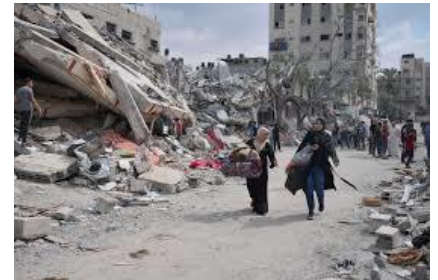
Gazans return to ruined homes 2025

Christian Zionists and other political factions here and abroad certainly support Israel's actions. A challenging component of our discipleship is the willingness to suspend certain allegiances and ideologies and to open our mind and heart to what may be initially hidden to us. This is precisely where humble prayer and presupposition enters.