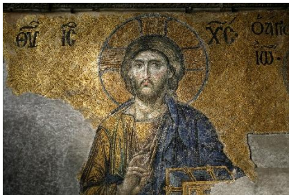
Deesis mosaic of Jesus at the Hagia Sophia