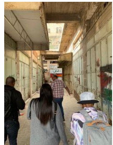
Shops closed and shuttered in Hebron, occupied West Bank.

As a follower of Jesus and a member of both the Quaker and Catholic communities, I find it hard to bear the pain (despite the extraordinary beauty, and integrity there) of accompanying Palestinians under attack in their homeland made possible only by our tax dollars and the long history of the distortions of Jesus' life and teachings. These are the relevant highlights of my time in Palestine.