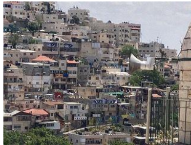
Silwan refugee camp in occupied East Jerusalem

Land narratives extended by the Doctrine of Christian Domination, sometimes euphemistically called the Doctrine of (Christian) Discovery, that have constituted the origin stories and belief systems governing western "civilization's" understanding and insistence on its inevitable destiny as the apex of possible life forms.