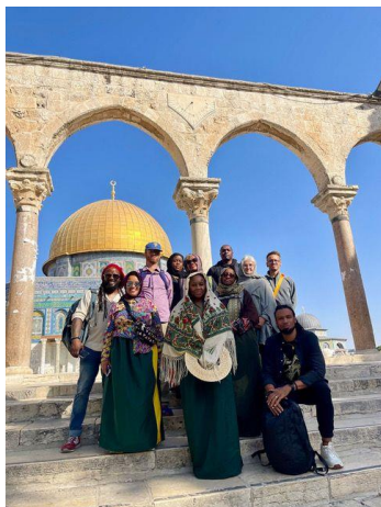
With Black Faith leaders Nov 2024

I've been asked to share two or three highlights from my time in Palestine, which I have been trying to do in the 17 (and counting) talks I've given since March last year, entitled "Pilgrimage to Palestine, Pilgrimage to Home: A Report Back". Besides the abiding deep faith and resilience of the Palestinian people in the face of 100+ years of incursion, occupation and genocidal apartheid, the biggest highlights for me have been discovery and deepening recognition of the