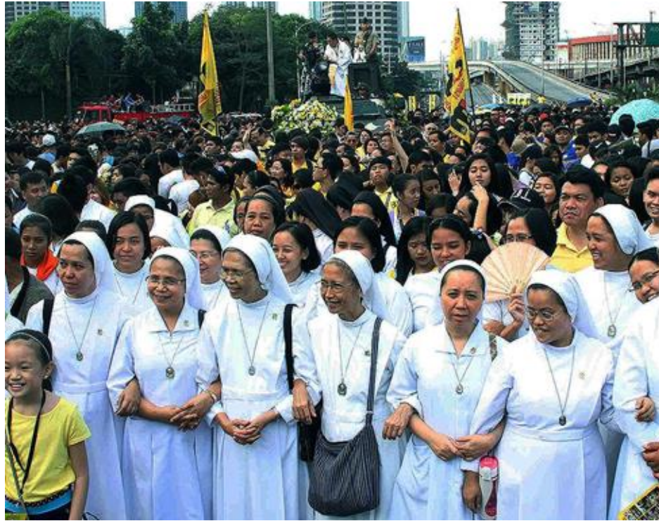
People Power Nonviolent Revolution, Philippines